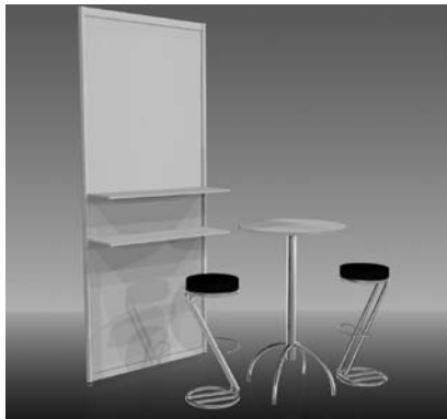
Furniture Package A

Please note: It is not possible to exchange the package contents for other items!