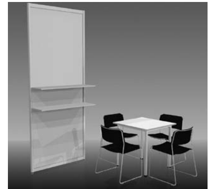
Furniture Package C

In addition to the basic equipment, we hereby order the following items (for an additional fee):