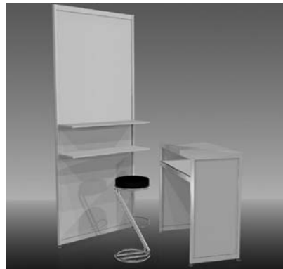
Furniture Package B